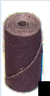
Straight Cartridge Roll

Master Cartridge Rolls are offered in Aluminium Oxide and Ceramic Oxide in 60-120 grit. A range of roll sizes is available from 6 to 19mm diameter and 25 to 50mm long with either a straight or tapered side according to application requirements.